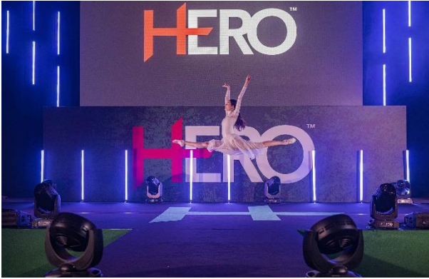
HERO Südtirol Dolomites

The AVIREX HERO Challenge will return for this edition, with cyclists racing against time when climbing the last two climbs of the three race trails.